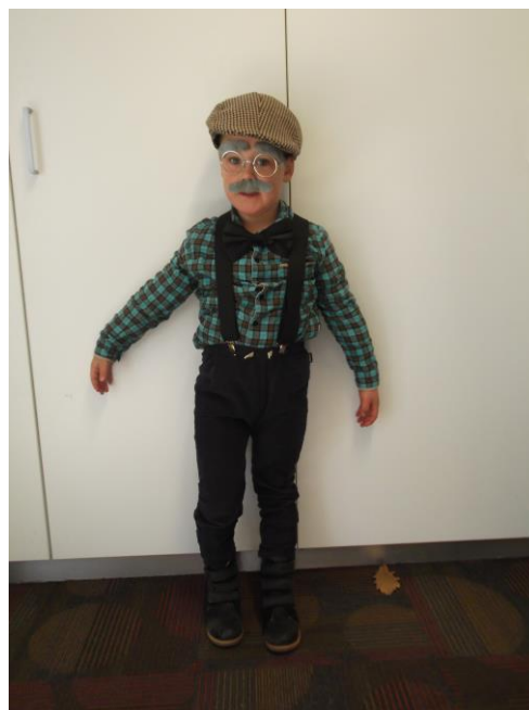
Preps 100 Days of School!